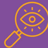
User-defined search set generation